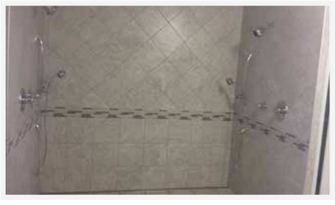
Shower updates at Deerfield House.

degree of individualized attention and support to the individuals residing there. Wall Residences works hard to support individuals to achieve their highest level of independence while encouraging the total health and well being of each individual in services. The mission of Wall Residences, which began when the first service was opened in 1995, carries over to Deerfield as it does to all Wall Residences services. Our mission continues to remain in place as Wall Residences and Deerfield continue providing individualized and person centered services with the best supports available from our committed and talented providers of our sponsored homes and the staff employed at Deerfield.